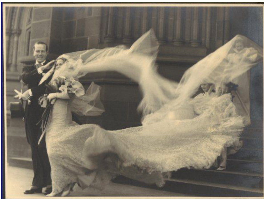
National Library of Australia